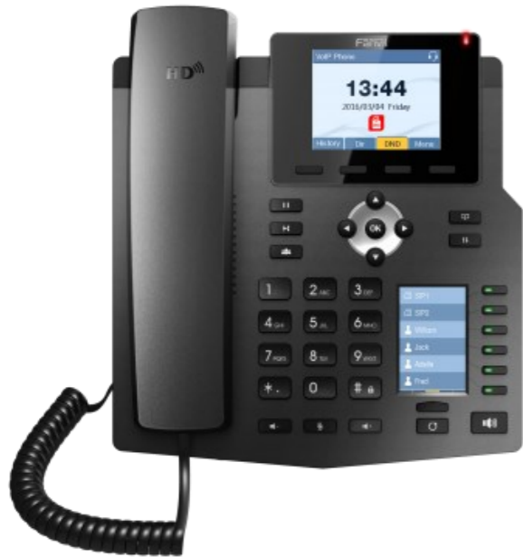
Fanvil X4 IP Phone